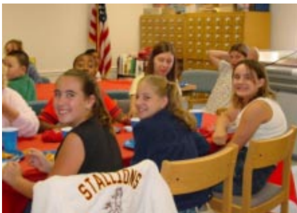
YAC teens enjoy a picnic meeting

Are you in Jr. High or High School? Join us at our next Youth Advisory Club (YAC) meeting, and bring your ideas about the kind of materials and programs you would like to have at the Library. It's a great way to contribute to your community, and we have food and fun, too! On your next visit to the Library, leave your name and phone number. Join us June 26 at 7 p.m.