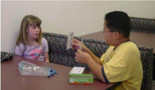
A “flash card fun” practice session in progress

The Library encourages students to practice their reading and math skills during the summer. Join our “Practice Pal” program which enlists the help of Junior High volunteers who work with younger children by playing educational games that help them enhance skills. Please register to be a Practice Pal or to participate!